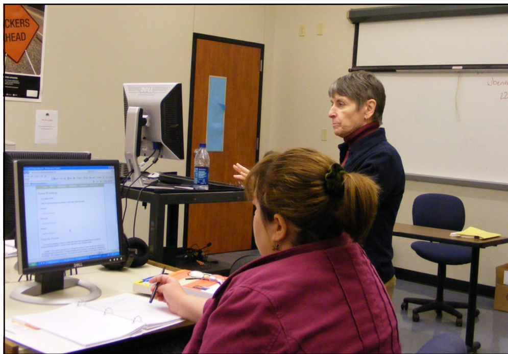
The Archival Training Collaborative hosted the final "Train the Trainer" workshop in Alexandria on March 5-7, 2010.

With the intention of capitalizing on the wealth of archival information on the Web, the Archival Training Collaborative (ATC) launched a three-year effort to establish a sustainable program of archival training for staff and volunteers in historical repositories in the states of Louisiana, Mississippi, and Alabama using the many well-developed training sites on the Web.