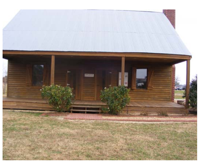
The Epps House