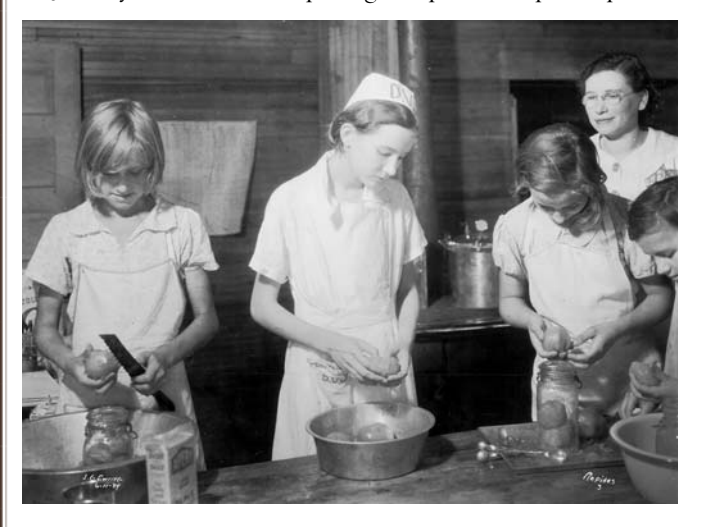
Canning fruit, c. 1934.

LSU Libraries Special Collections will be hosting two exhibits this fall. The first is entitled The Greater University and illustrates LSU's move to its present campus. This exhibit will run from September 2 to December 20, 2014. The second exhibit is Cooperative Extension at LSU commemorating the centennial of the Smith-Lever Act of 1914 and will run from September 22, 2014 to January 24, 2015. An opening reception and public pro-