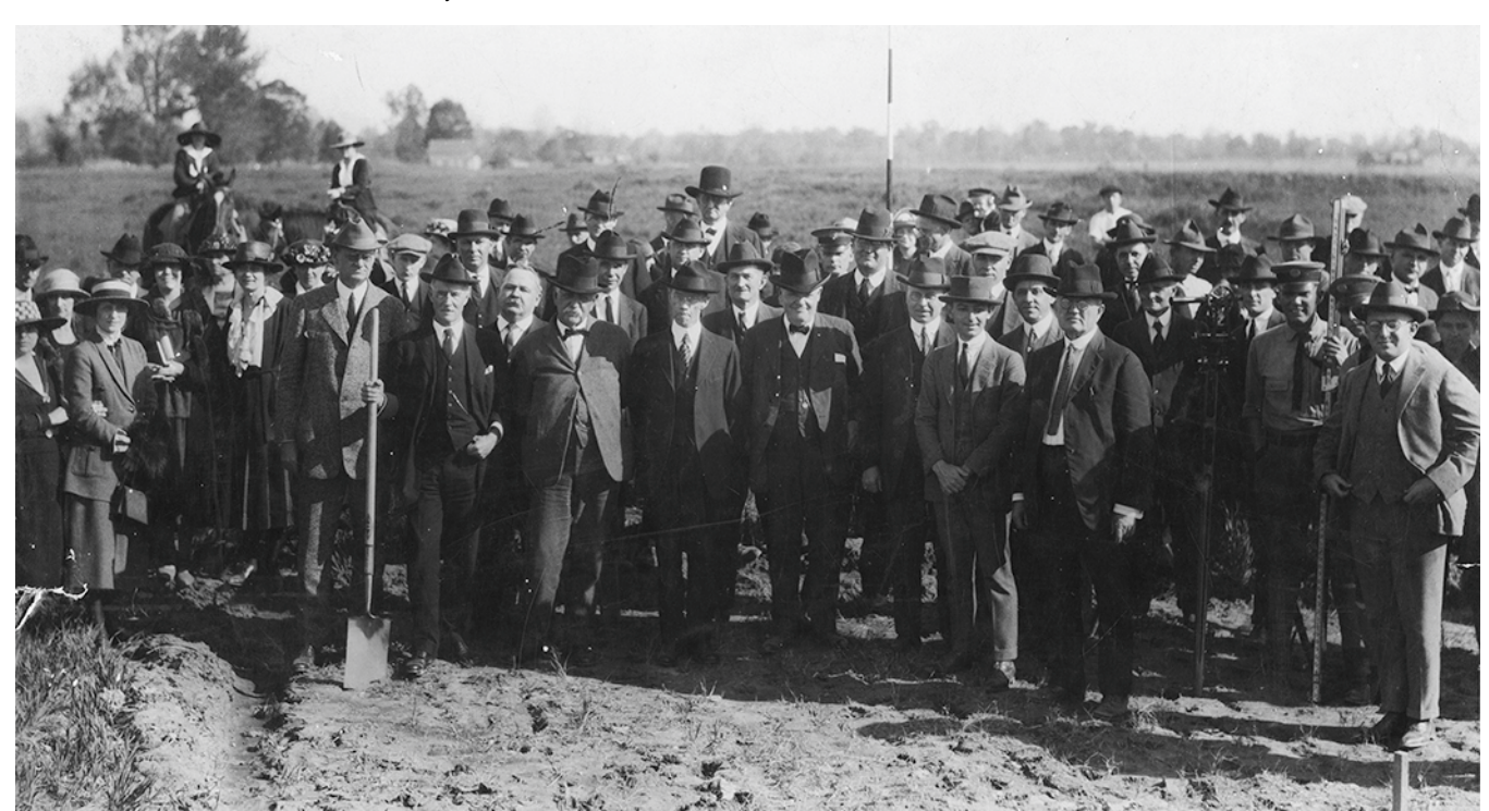
Groundbreaking ceremony for LSU's dairy barn, March 29, 1922.