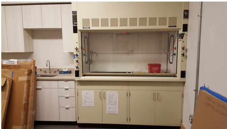
Refurbishment of the original conservation hood and workspace.

To accommodate and properly house the new donations of uniforms, photographs, and other artifacts, the original vault space was expanded into two additional spaces, essentially doubling its square footage. Storage capacity has also been streamlined and made more efficient by installing a medical records type filing system for donor files and built-in book shelves to house a small curatorial reference library. In addition to independent HVAC and security systems, the vaults are serviced by the largest pre-coordinated clean agent fire suppression system ever installed by the company Amerex.