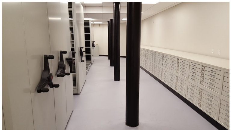
Dedicated space for 2-D artifacts and expanded flat file storage.

When the National WWII Museum opened on June 6, 2000, it was as the D-Day Museum and just two employees were on staff to oversee collections. With the United States Congress' designation in 2005 of the museum as the nation's official World War II museum, a new mission was created and growth exploded, not only of the museum's campus, but also in the influx of new accessions. The museum currently houses over 16,000 collections, some consisting of only one artifact to others with thousands of individual items. Each collection is built around an individual's military or civilian wartime story. Much of this growth can be accounted for not just in the renewed mission and public awareness of the museum, but in the specific population it represents; only 620,000 of the 16 million Americans who served in World War II were still alive in 2016. With their children also now retiring and downsizing, an increased sense of urgency has been placed on finding a home for their families' treasured history and memories.