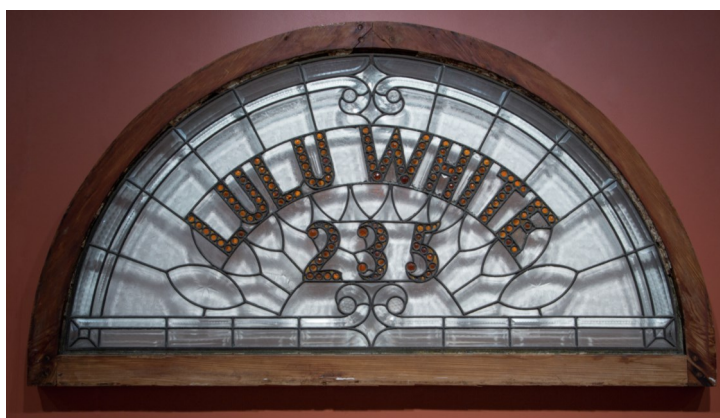
Transom from Mahogany Hall; ca. 1898; wood, lead, clear beveled and patterned glass, clear and amber glass jewels; The Historic New Orleans Collection , acquisition made possible by the Laussat Society, 2017.0020