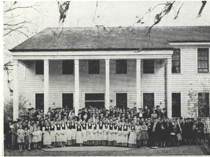
MacDonell School Children, Council and Conference Women at Evangeline Luncheon, March 12, 1940, Minutes of the thirtieth annual session of the Woman's Missionary Society, Louisiana Conference, Methodist Episcopal Church, South, 1940.

The Centenary College of Louisiana Archives and Special Collections has completed a collaborative project to digitize its collection of publications by the Louisiana United Methodist Women and their predecessor organizations. The digitized material includes annual reports (1884-2014) and newsletters (1963-2006) – 12,000 pages in total. Researchers can access them online, page through each volume, download complete PDFs, and search the full text versions. The publications detail the activities of Methodist women, and they complement the Louisiana United Methodist online collections managed by Centenary College.