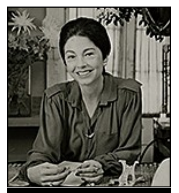
Mignon Faget: A Life in Art and Design is on display at the Historic New Orleans Collection until January 2, 2010. The exhibit details Faget's 40-year career in jewelry design and includes hundreds of original drawings and photographs.